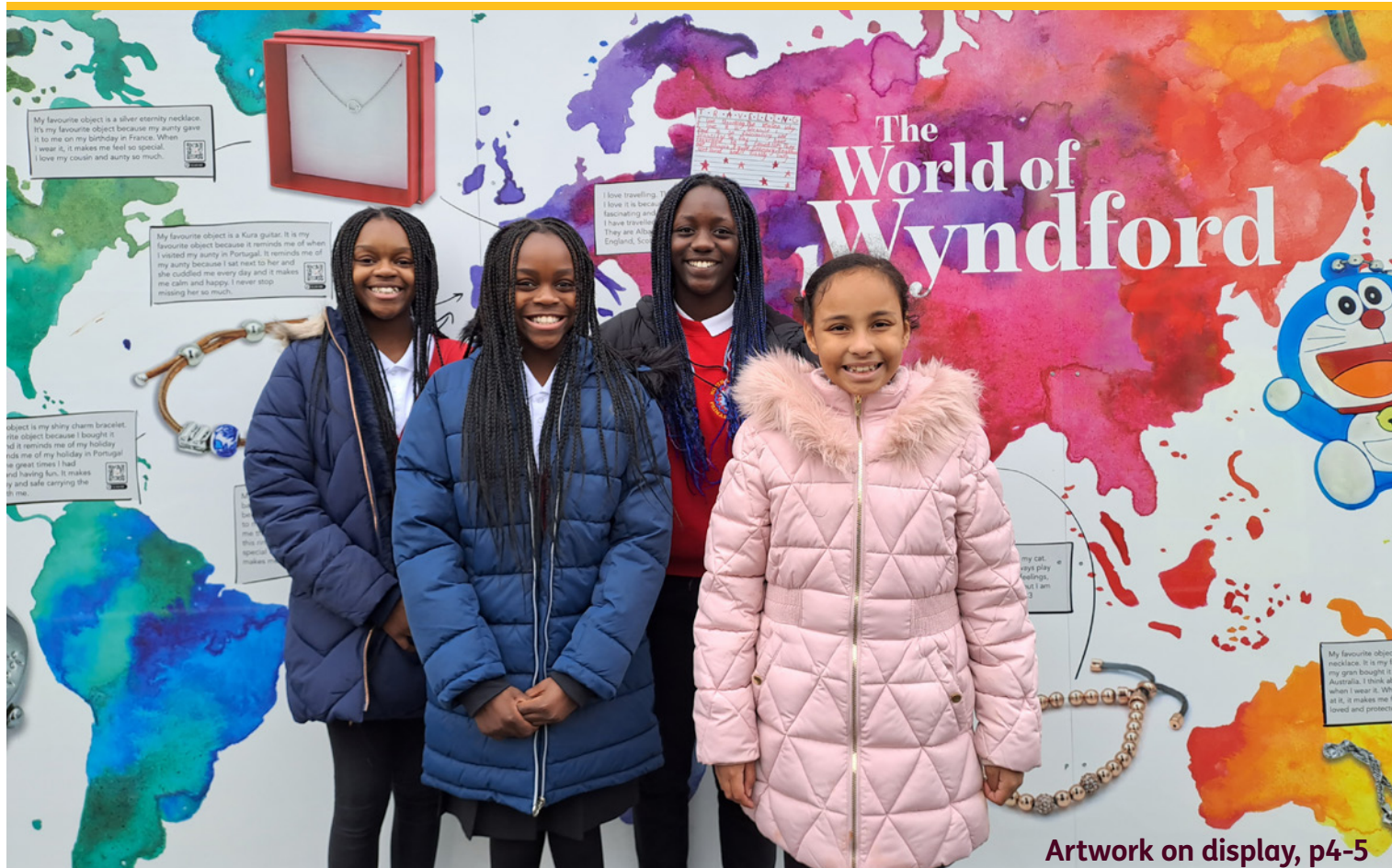
Artwork on display, p4-5