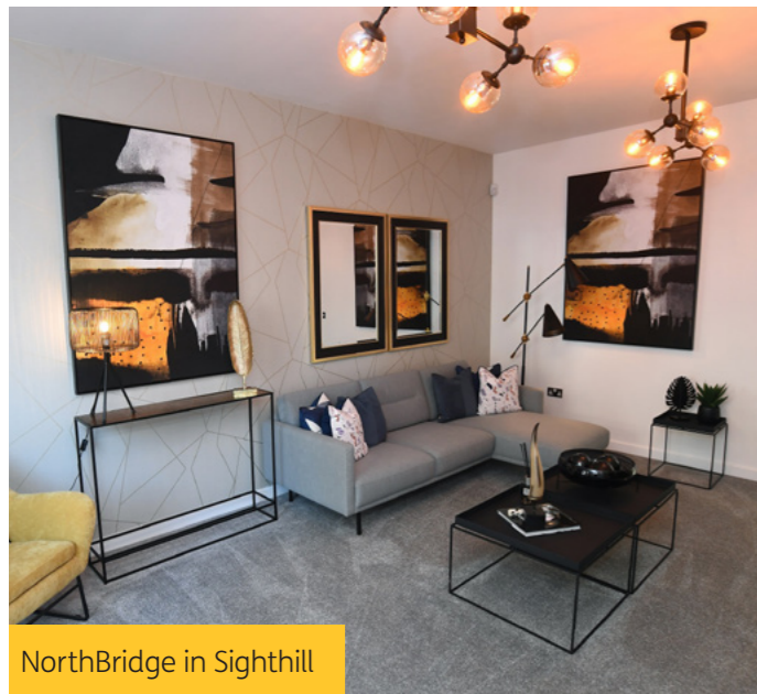
NorthBridge in Sighthill