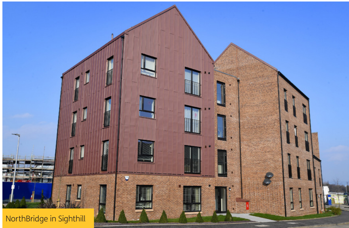
NorthBridge in Sighthill