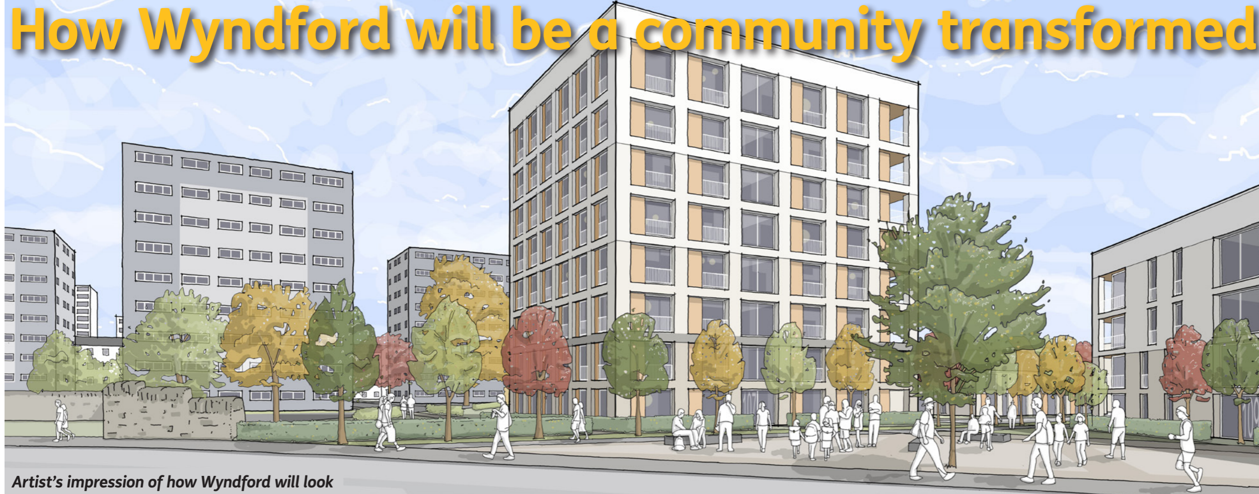
Artist's impression of how Wyndford will look

Hundreds of family homes and a new community hub are at the heart of a multi-million-pound transformation at Wyndford.