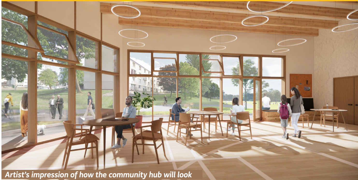
Artist's impression of how the community hub will look